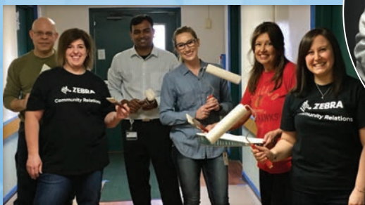
Volunteers from Zebra Technologies Corporation

For all of you who have generously impacted and affected our residents' lives, Thank you for your support!