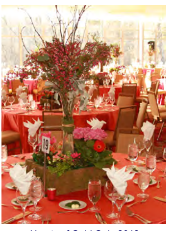
Hearts of Gold Gala 2018