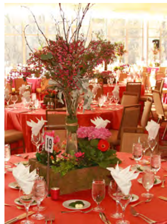
Hearts of Gold Gala 2018